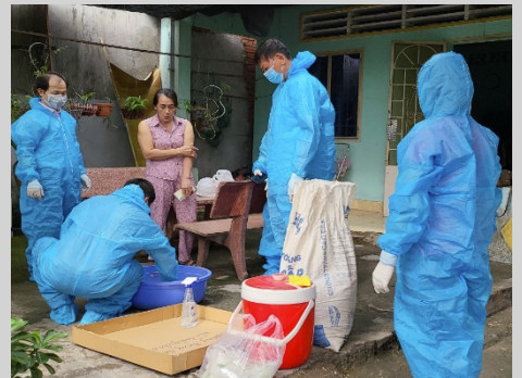
TIP-2: A comprehensive approach to improving waste management, handling, and processing on wildlife farms (priority given to civet and bamboo rat farms).