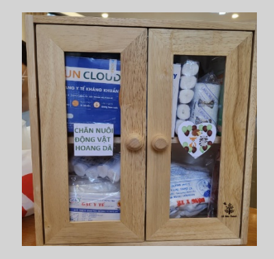
TIP-3: Improved biosafety and biosecurity through health care, disease control and disease surveillance for farmed animals