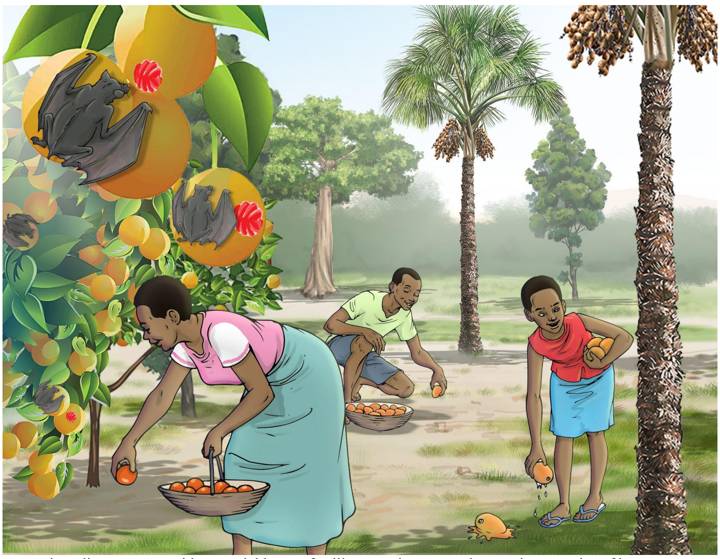
Fruit pickers come into direct contact with potential hosts of spillover pathogens such as various species of bats.