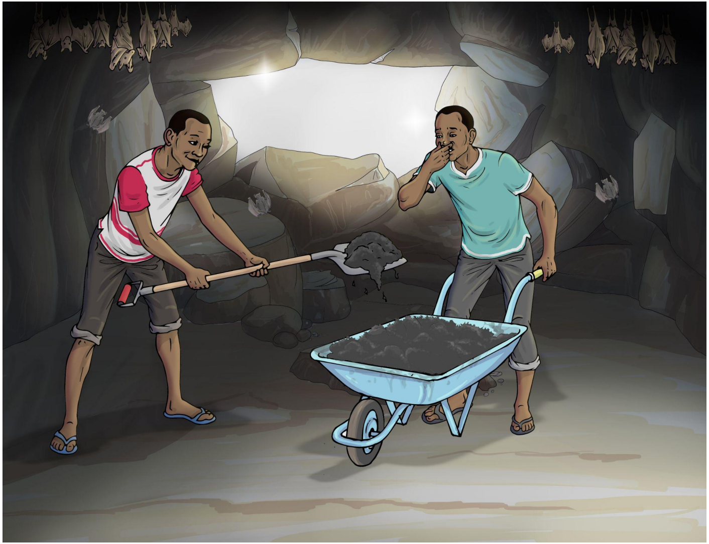
Bat guano has long been recognized worldwide as a source of fertilizer. Collecting bat manure from caves is practiced in Bundibugyo and other districts in Uganda.