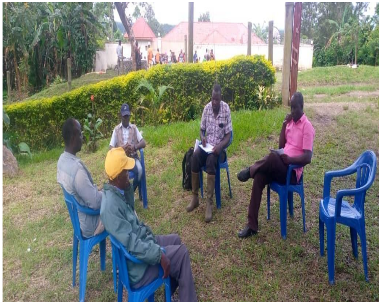
Figure 4. A key informant interview for a bat consumer in Ntandi Town Council.