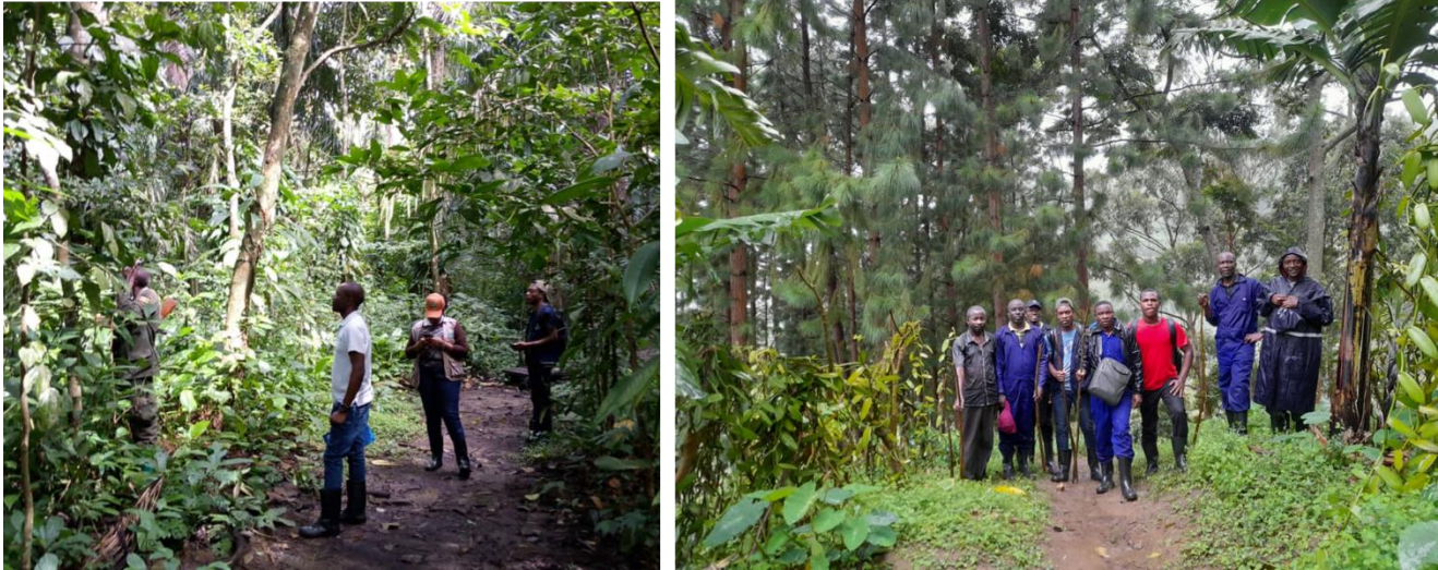
Figure 5: Transect walks, direct observations and bat roost mapping in Semuliki National Park and Harugale subcounty bat cave observation and mapping.