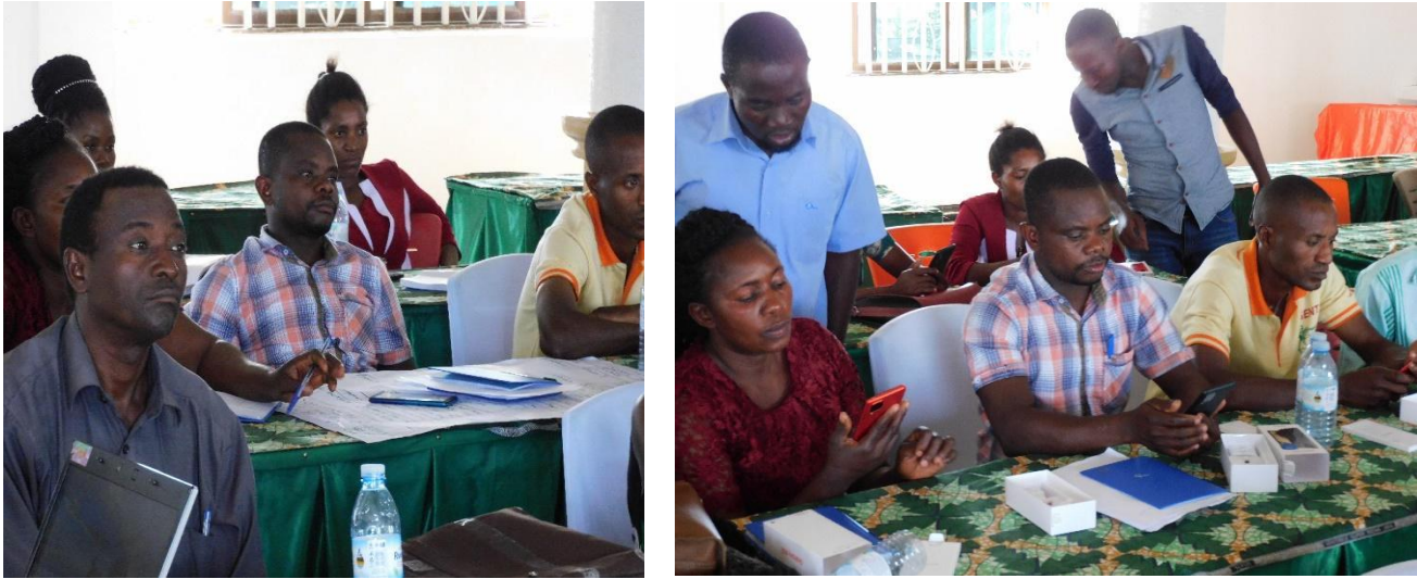
Figure 7: Training of fifteen (15) Bat monitoring agents on the use of Kobo collect tool. (Photo Credit: OHDREAM team).