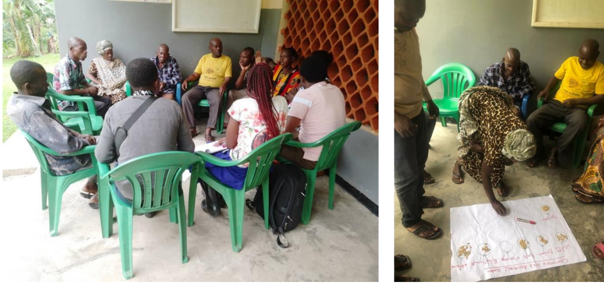
Figure 3: A focus group discussion and community use of proportional pilling in ranking commonly destroyed fruits by bats.