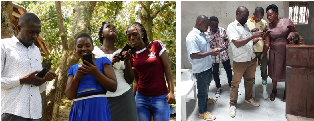
Figure 8: Field illustration on the use of kobo collect tool to collect data from different bat roosts.

The team reconvened and visualized the initial set of data that had been collected. Demonstrations were done on how the data will be visualized to ensure data quality and confirm authenticity of the information collected by each agent. Challenges seen while using the tool in the field were forwarded and discussed. Refinements and edits on the tool were done and the new tool was deployed.