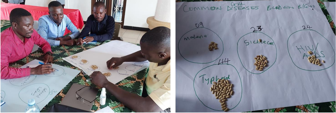
Figure 2. Participants were grouped into 3 groups in line with the intervention sites, each group was tasked to create a topic of interest and demonstrate on the use of participatory epidemiology tools.