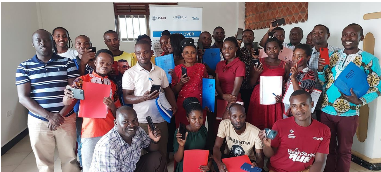
Figure 9. Launching the bat monitoring program with the required gadgets by the monitoring agents.

The Chief Administrative Officer (CAO) launched the bat monitoring program (Figure 9) and advised the monitoring agents to collect all the satisfactory data to enable the project get detailed necessary information that will be used to draw a good conclusions and way forward. The CAO further appreciated the STOP spillover project efforts in Bundibugyo, and promised to support the project as required by the project team.