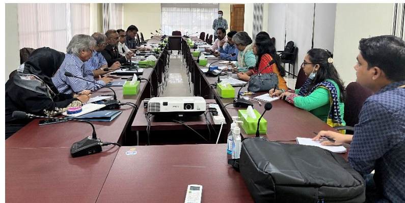
Group discussion on coordinated information sharing platform