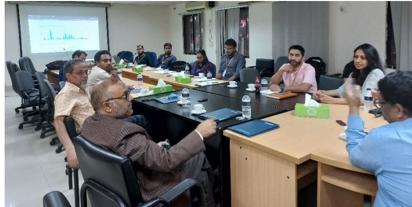
Group discussion on integrated data sharing platform