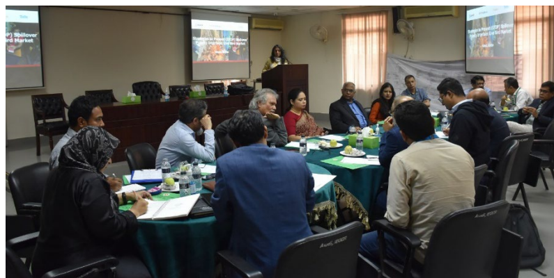
Discussion on coordinated platforms at National One Health Secretariat Coordination Committee meeting