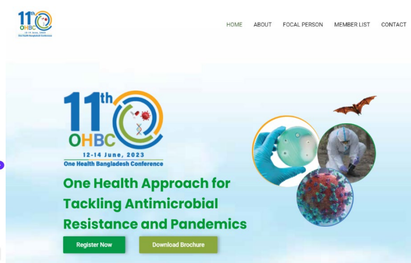
One Health Event Based Surveillance System Dashboard