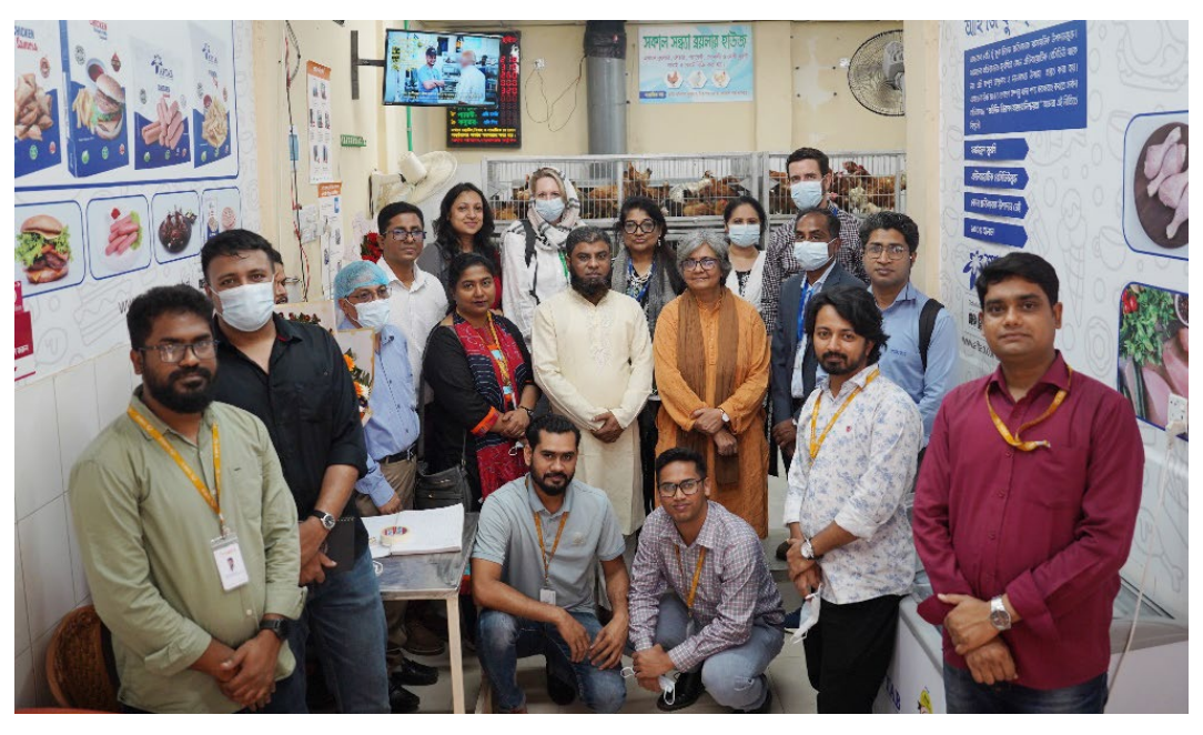
Inauguration of renovated LBM with improved biosafety conditions

On March 18, 2024, a formal inauguration event was held to mark the launch of the biosecure poultry shop, with representatives from USAID, Institute of Epidemiology Disease Control and Research and One Health Secretariat, Tufts University, Islam Group, and icddr,b. Representatives found a renovated, clean, and attractive shop where biosafety standards are implemented to reduce risks to vendors and customers alike.