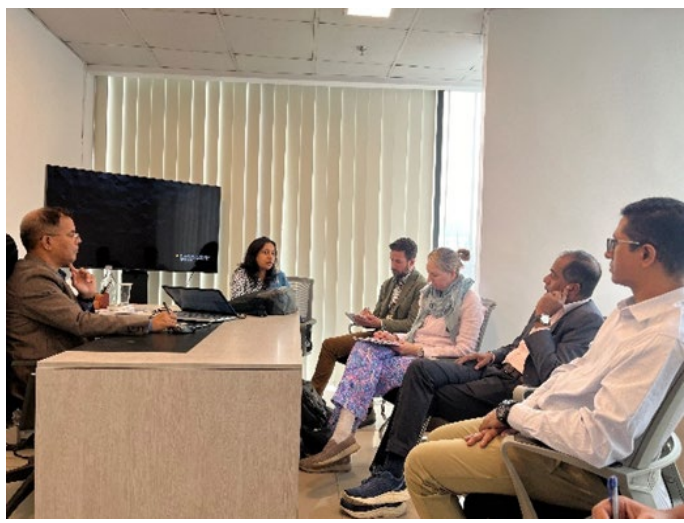
Meeting at DNCC